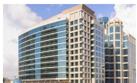
FT. LAUDERDALE, FL